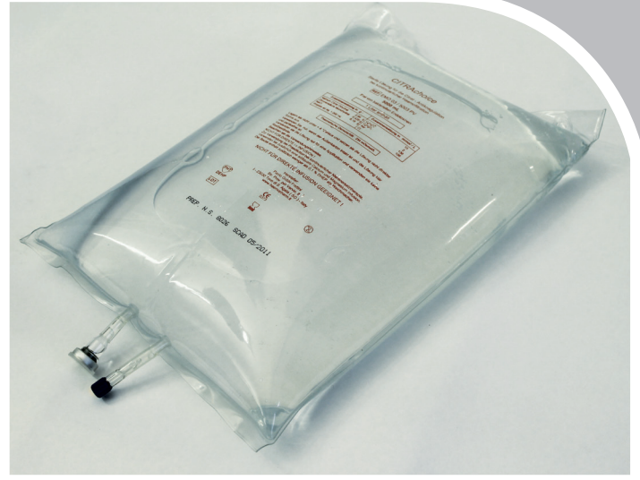
CITRACHOICE - Citrate for Hemofiltration. Custom formula available