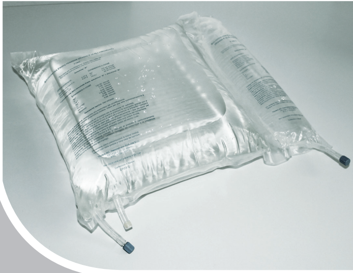
HFS - Hemofiltration double bag. Custom formula available